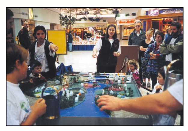
Passers-by at the shopping mall look on as kids learn about nonpoint source pollution

An introductory brochure includes some key advice: "The model should be located outside the school whenever possible. Model facilitators will need easy access to water and a sink or storm drain close to where the model is located. Participants are in groups of 15 and can range in age from kindergarten to adult."