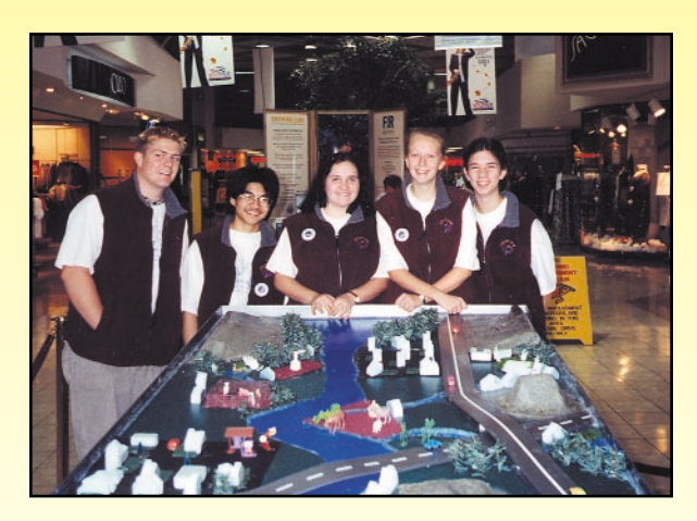
Stream Team students ready for a demonstration of the Colquitz River model