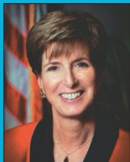
EPA Administrator Whitman